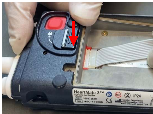
Figure 1: Connection of Backup Battery Ribbon Cable

In the confirmed complaints, Abbott identified corrosion at the connection point between the System Controller and the Backup Battery ribbon cable. This can be caused by excessive handling and movement of the ribbon during Backup Battery installation or replacement, specifically at the ribbon cable connection interface, see Figure 1.