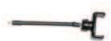
PHONE HOLDER WITH PIVOT MOUNT