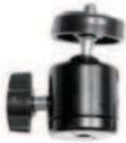
ROTATING BALL HEAD