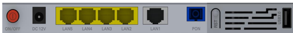
Figure 4. Interface/button Panel, RST and USB on the side of the device.