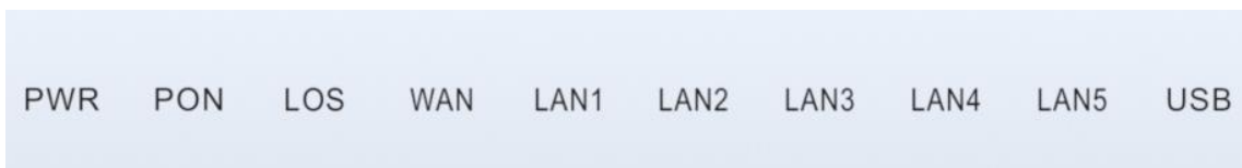
Figure 3. Panel Lights