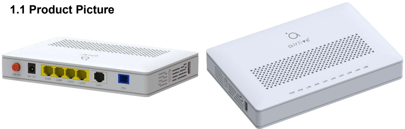
Figure 1. ONU-10XG(S)-1004-10G