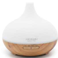
Diffuser * 1