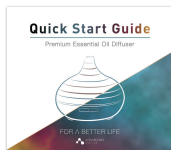
User Guide * 1