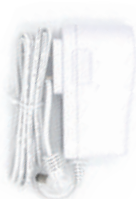
AC Power Adapter * 1