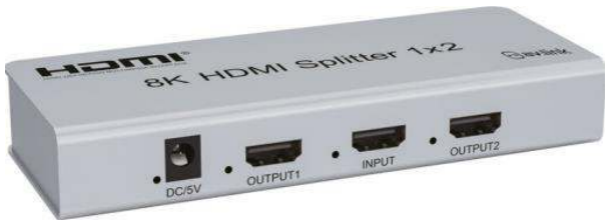
8K HDMI Splitter with EDID Item ref: 128.861UK User Manual