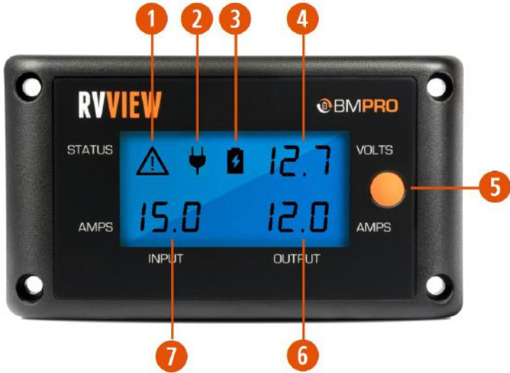
Figure 1: The RVView Monitor