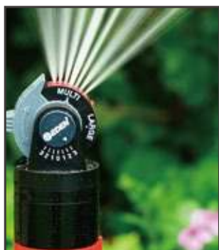
HIGHER LEVEL (1-3):

Move the angle cap to control the distance of your watering area. The higher level will create a higher arc for greater water coverage. The lower level will reduce the watering area. Convenient indicators help you remember your settings for next time.