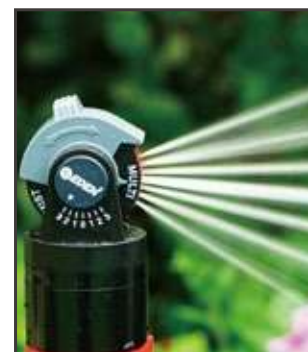
LOWER LEVEL (3-1):

Adjust the spray in between a dispersed and concentrated watering area.