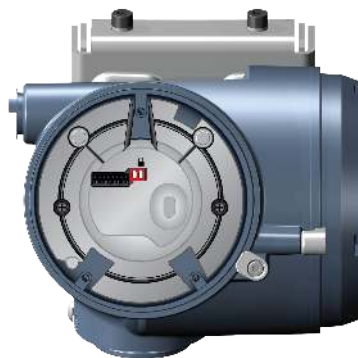
Figure 2-3: Write protect (dip) switch behind the display module

Write protection is enabled by toggling the physical write protect (dip) switch (identified by a lock icon) located behind the display module.