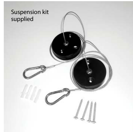
Suspension kit supplied