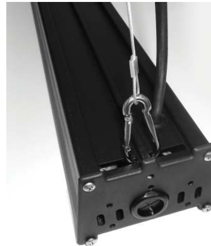
Suspension kit supplied - 1m cable length