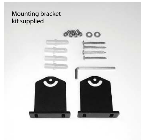
Mounting bracket kit supplied