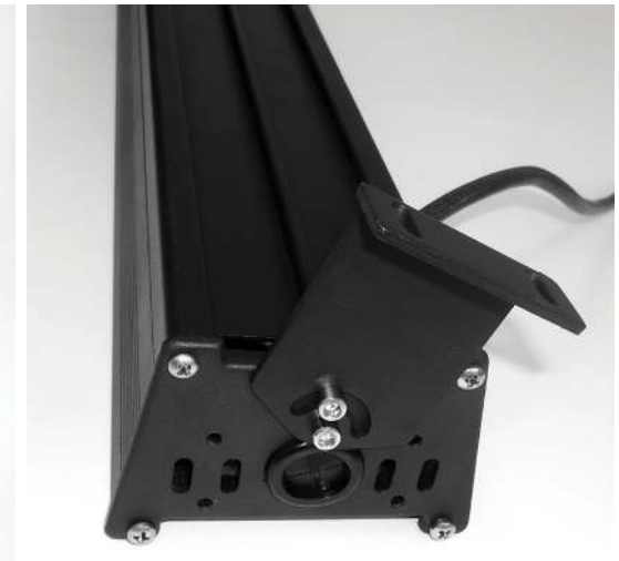
Adjustable mounting bracket kit supplied for installing the fitting at a specific angle