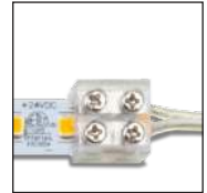
Tape to Tape Tape to Power (Options with and without wire)