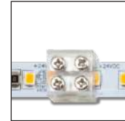
Tape to Tape Connector