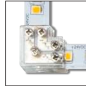
90° Tape to Tape Connector