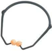
PerCap® Folding semi-aural protection