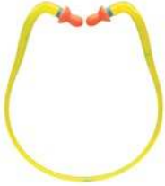
QB1® HYG Inner-aural protection

An alternative for those who work in intermittent noise or for managers and visitors who move in and out of noisy areas.