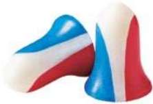
Max ® USA Patriotic red, white, and blue colors

NRR 30 MAX-1S MAX-30S CAN A(L) uncorded corded