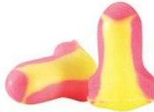
Laser Lite ® Highly visible protection

NRR 33 MAX1-USA MAX30-USA CAN A(L) uncorded corded