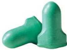
Max Lite ® Low pressure foam for comfort

NRR 33 MAX-1 MAX-30 CAN A(L) uncorded corded