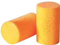
FirmFit ® Firm foam reinvented

NRR 32 XTR-1 XTR-30 CAN A(L) uncorded corded