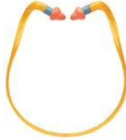
QB2® HYG Supra-aural protection