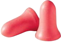
Max ® Highest NRR in disposable

An economical and convenient choice for work situations that demand a high degree of comfort, or where hygiene presents a problem for reuse. Formable foam is also THE material of choice when highest attenuation is required.