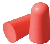
X-TREME ® Tapered design for comfort

NRR 32 LL-1 LL-30 CAN A(L) uncorded corded