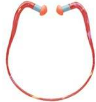
QB3® HYG Semi-aural protection