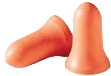
Max Small ® Comfort for smaller ear canals

NRR 30 LPF-1 LPF-30 CAN A(L) uncorded corded