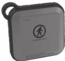
10,050 mAh Power Bank/Lantern