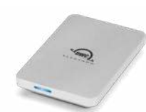
OWC Envoy Pro Elektron