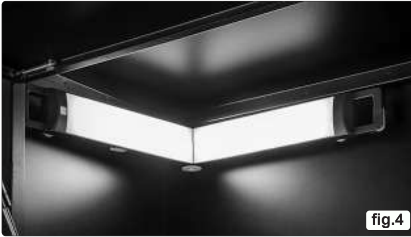
Corner light for inside tool box or overhead cupboard