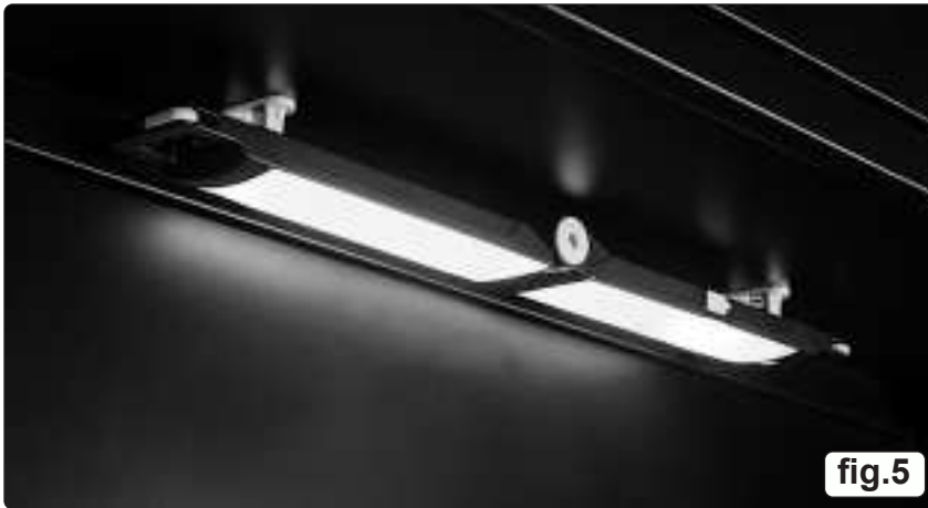
Magnetic feet which pull out from the internal sides of body. So can be mounted on any magnetic surface.