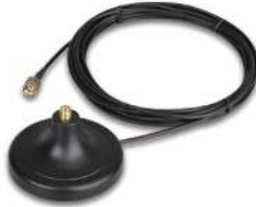
Figure 7: RP-SMA Wi-Fi antenna extension cable with stand - 3m