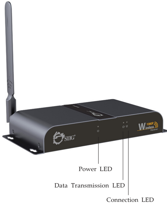
Figure 3: Receiver (RX) - front side