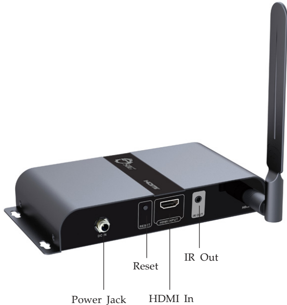
Figure 2: Transmitter (TX) - rear side