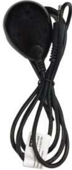
Figure 5: IR blaster extension cable (IR OUT)

The IR Extension feature allows you to control your HDMI source device from a remote location.