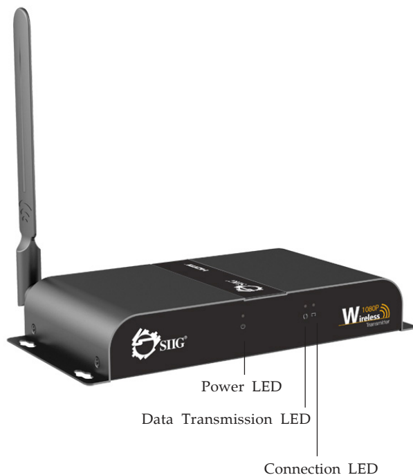
Figure 1: Transmitter (TX) - front side