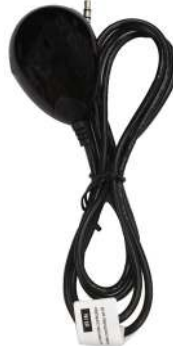
Figure 6: IR receiver extension cable (IR IN)