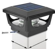
3 inch x 3 inch