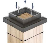
4 inch x 4 inch