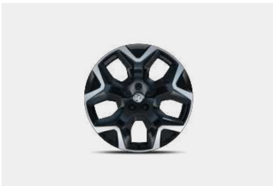
19-inch alloy wheel.