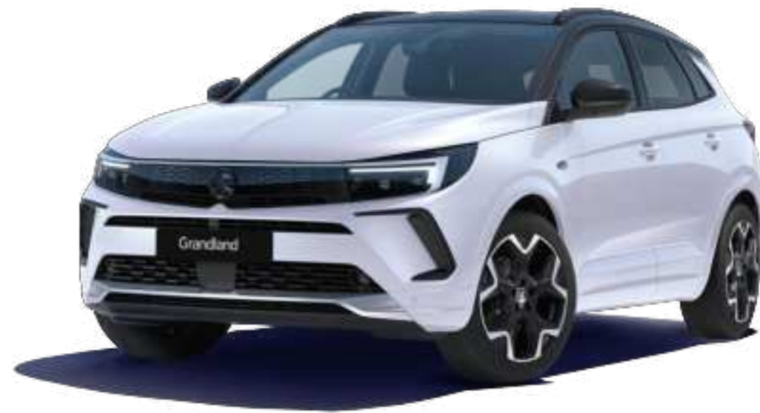
Arctic White (OMPO/ONWP)* Brilliant paint