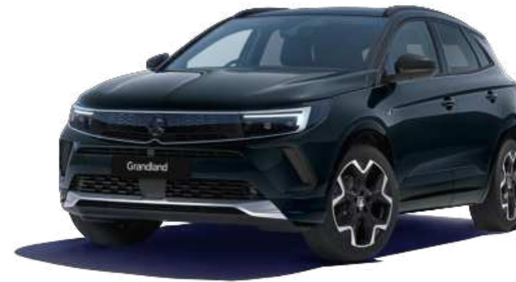
Carbon Black (OMMO/ON9V)** Two-coat metallic paint £600