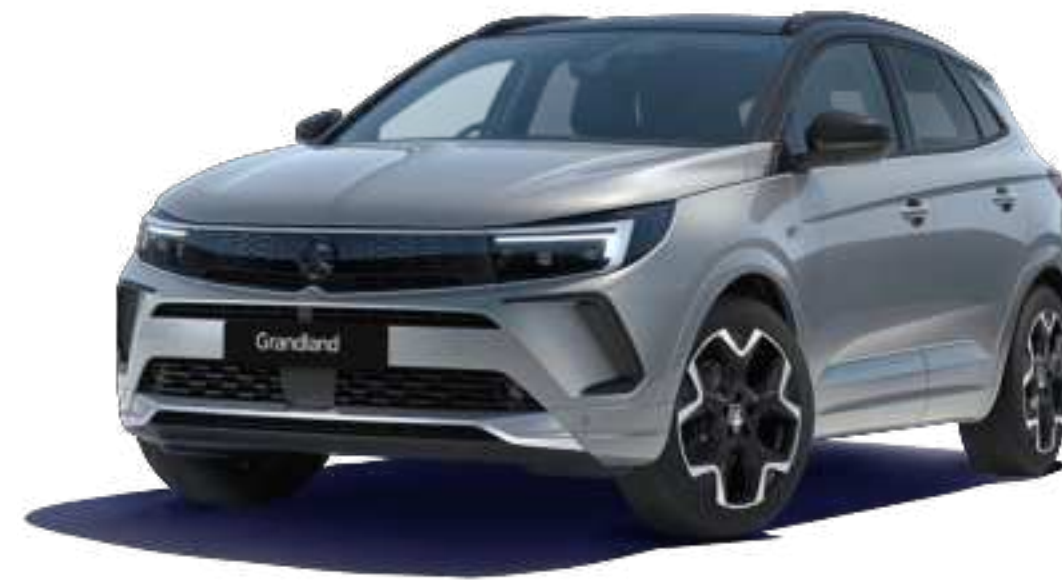
Contrast Grey (OMMO/ONF4)** Two-coat metallic paint £600