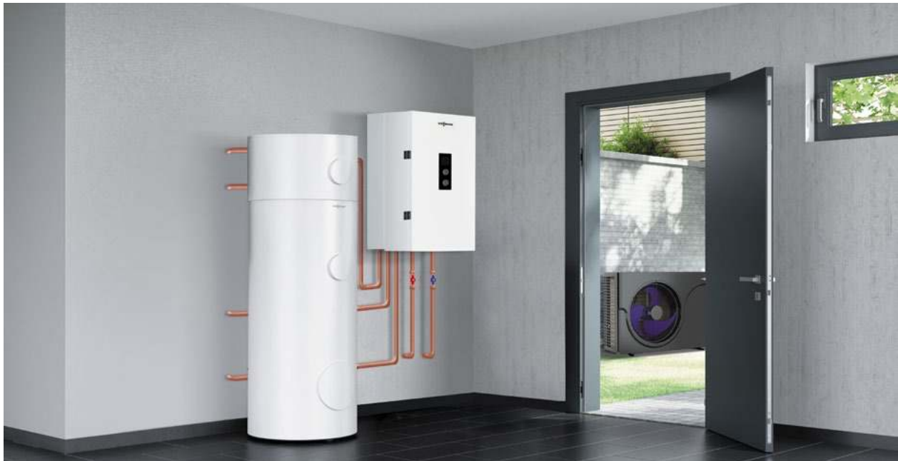
The Vitocal 100-AW offers a complete solution for residential applications. The optional domestic indirect tanks are available in three sizes, 53, 66 or 79 gallons.

▀ The Vitocal 100-AW is a true all-in-one kit with indoor unit, outdoor unit, and buffer tank. The easiest way to add heat pump hot water. ▀